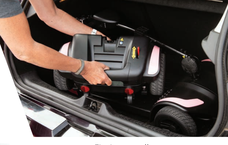
Fits in a small car

With an impressive minimum turning diameter of 115 cm, the One scooter excels as a compact indoor mobility solution, ideal for daily trips to the supermarket, restaurant visits, or manoeuvring through small spaces with ease.